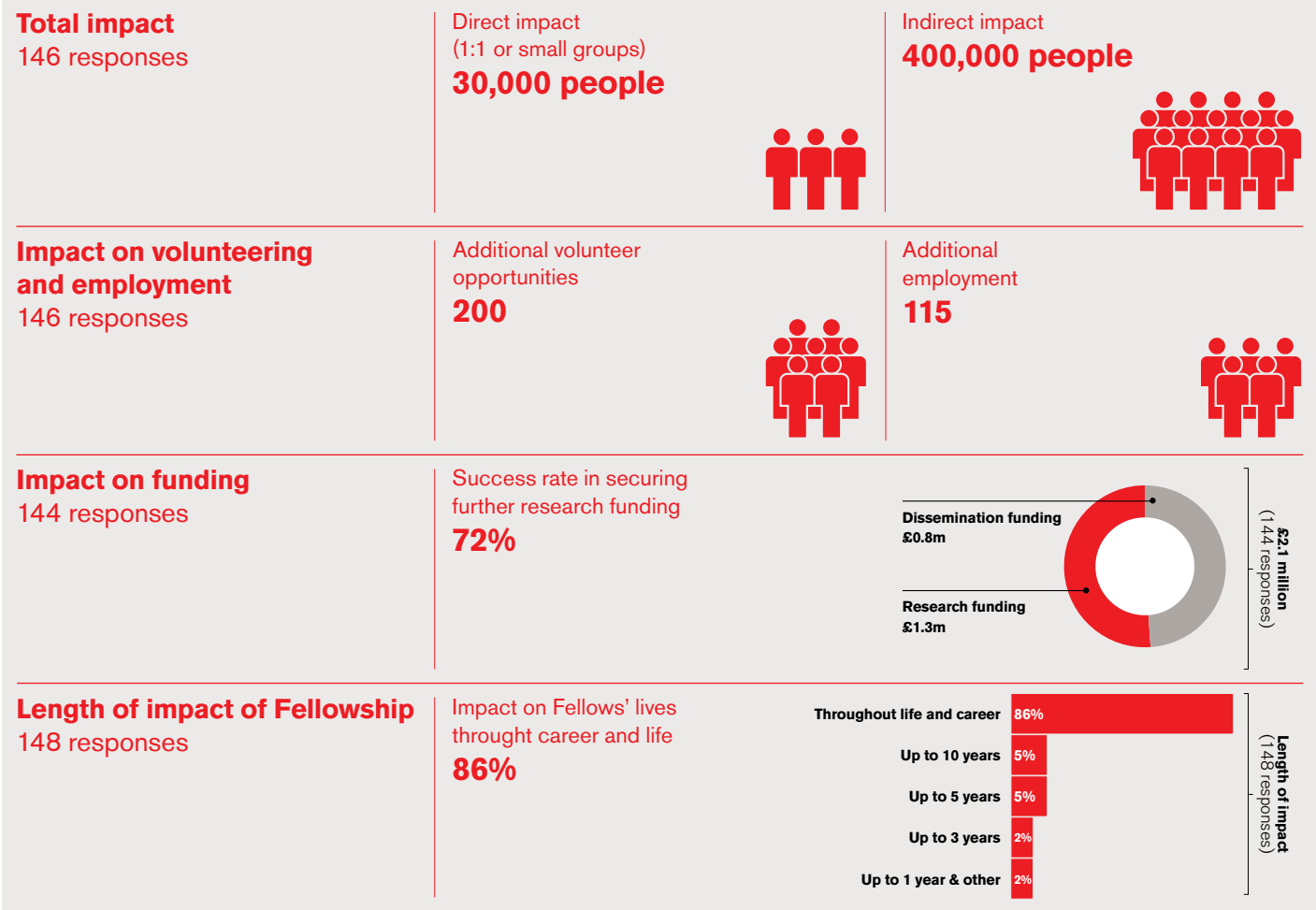
Results based on responses from 148 Fellows who travelled 1, 3 and 5 years ago.

“Having the opportunity to spend a protected amount of time observing, learning, listening, engaging, participating with the programmes I had merely read about for years had a profound impact on me personally and professionally. It took my understanding of my topic way beyond my previous understanding and opened my mind to a range of other issues I had previously not considered. Professionally, the knowledge and experience I have gained from operationalising my Fellow’s Report recommendations have developed my ability to bring about change and transformation and drive a solution-focused approach in an agile way that reacts to the opportunities and challenges of the environment. I am a different person as a result of my Fellowship. I am a different professional as a result of my Fellowship.”