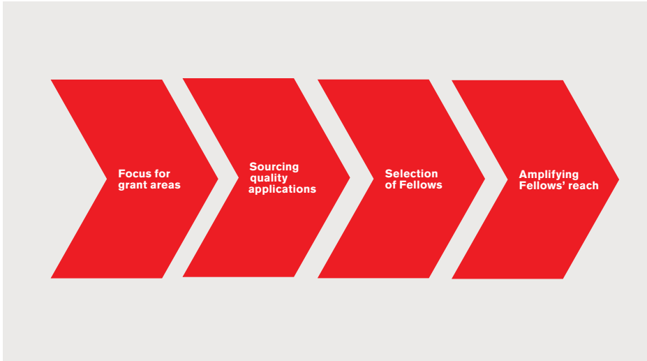
Figure 2 – Advisory Council's four strategic functions